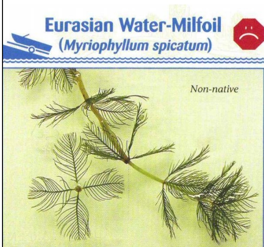
Highly invasive plant, able to form dense mats near the surface that entangle motor boat propellers and interfere with swimming. Spread by watercraft and trailers.

The Association also maintains a website, which is full of information regarding the lake, history, current news, recent rainfall, etc. You will find that at: http://www.roundthelake.com .