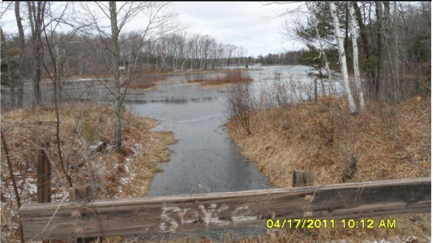
Water is flowing through the Carlson Rd. dam. More photos at www.roundthelake.com .

Round Lake Marina specializes in Dock & Lift Sales & Service. We sell Pier Pleasure, Shoremaster & Shorestation docks and lifts. Celebrating our 28th year in business.